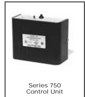
Series 750 Control Unit