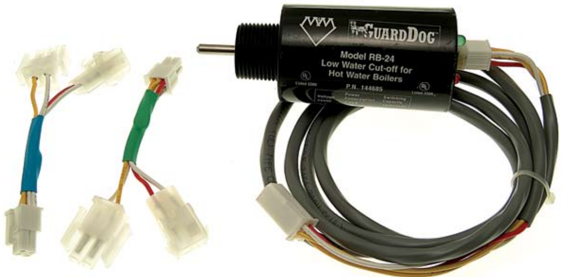
RB-24S for sealed combustion boilers with electronic burner or aquastat