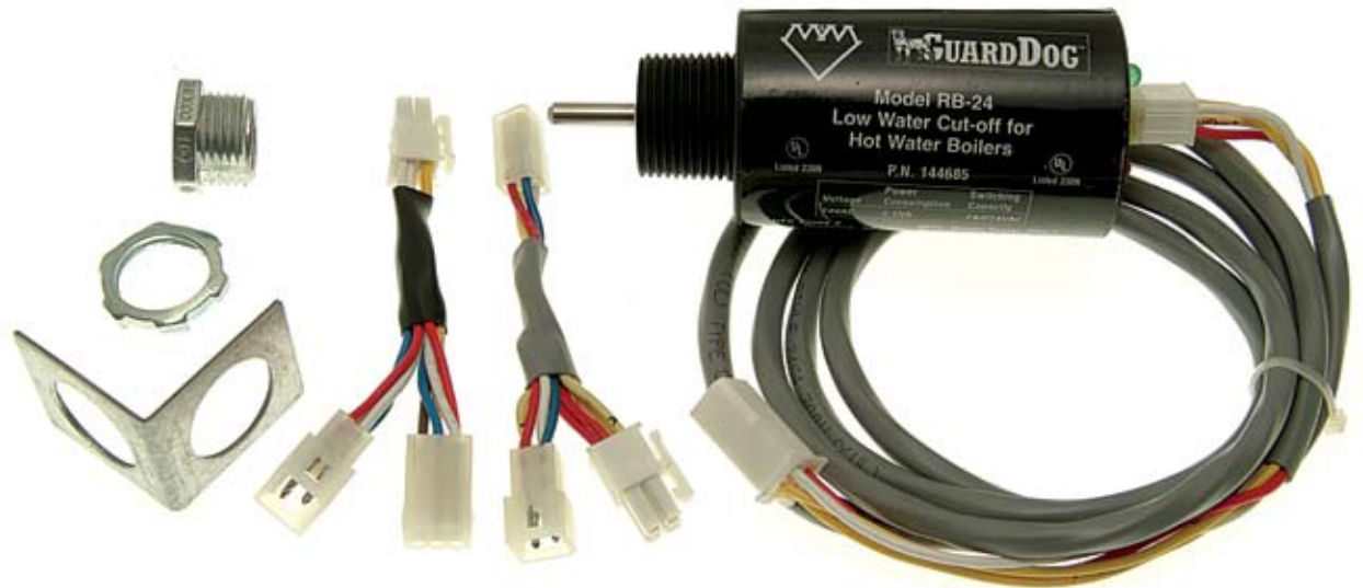
RB-24A for atmospheric boilers with vent damper